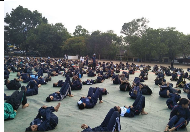
INTERNATIONAL YOGA DAY, 2 MAH GIRLS BT. UNIT