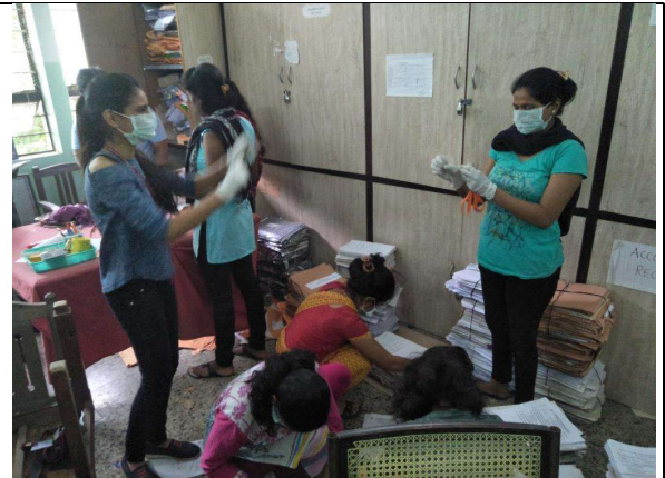
SHRAMDAN (CLEANING OF HISTORICAL MONUMENT)