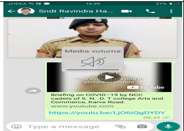
COVID-19 AWARENESS THROUGH SOCIAL MEDIA (YOUTUBE)

Motto of NCC Unity and Discipline एकता और अनुशासन