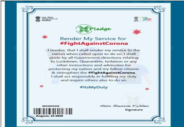
COVID-19 ONLINE TRAINING CERTIFICATE