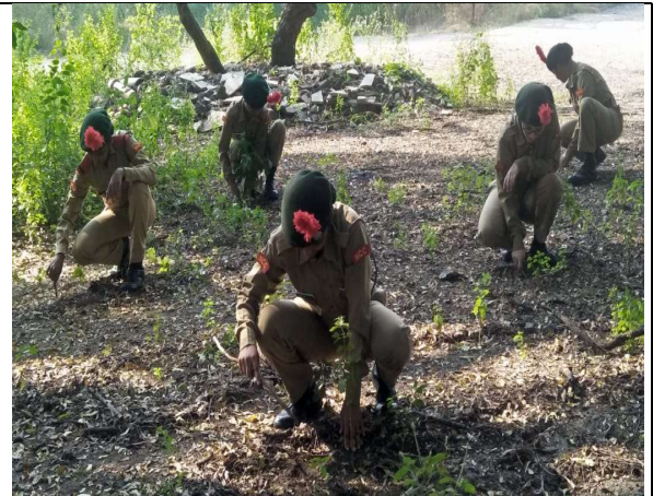
TREE PLANTATION DURING PANDEMIC