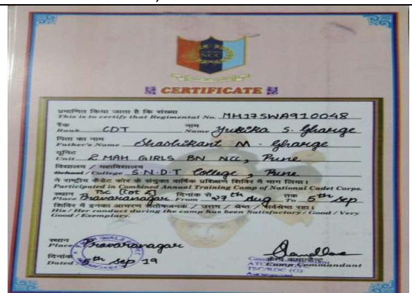
THAL SAINIK CAMP-II, PRAVARA NAGAR

Motto of NCC Unity and Discipline एकता और अनुशासन