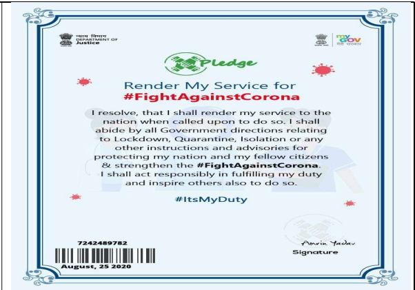
COVID-19 ONLINE TRAINING CERTIFICATE