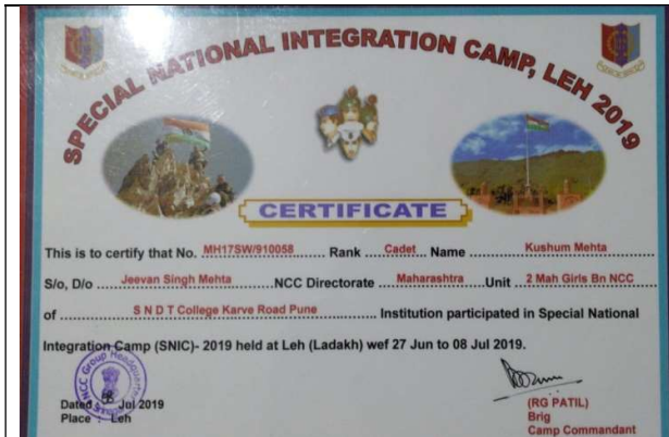
SPECIAL NATIONAL INTIGRATION CAMP, LEH-LADDAKH