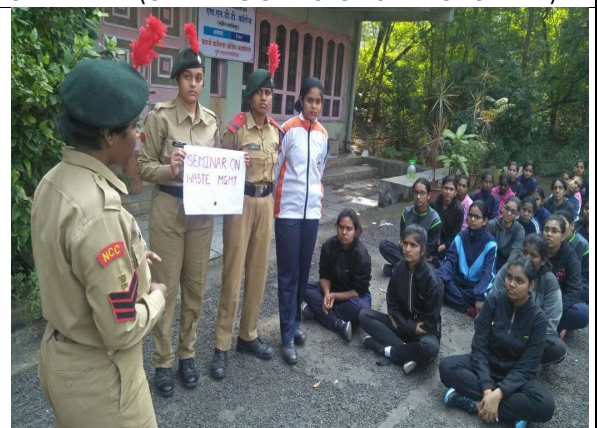
SEMINAR ON PLASTIC WASTE MANAGEMENT

Motto of NCC Unity and Discipline एकता और अनुशासन