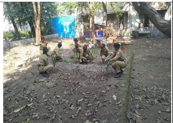
TREE PLANTATION DURING PANDEMIC