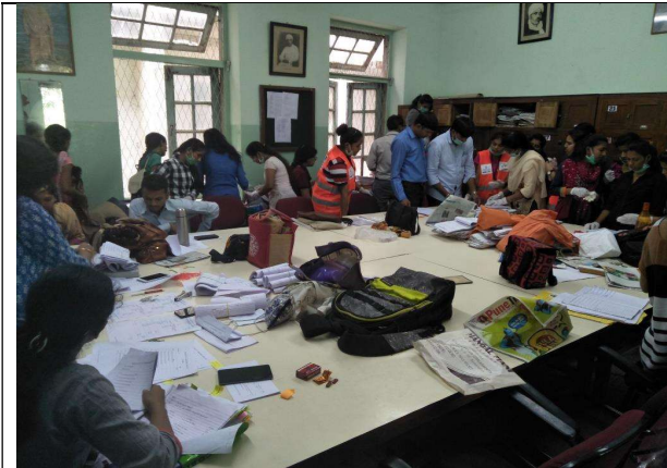
SHRAMDAN (CLEANING OF HISTORICAL MONUMENT)