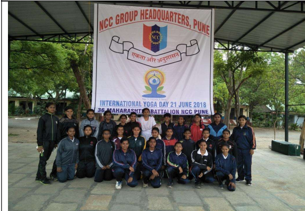
INTERNATIONAL YOGA DAY, 2 MAH GIRLS BT. UNIT