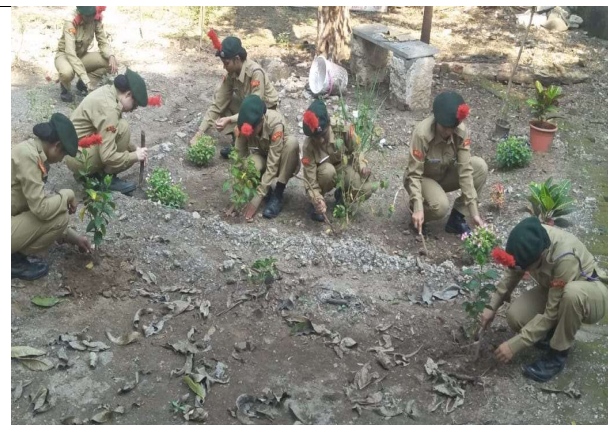
TREE PLANTATION DURING PANDEMIC