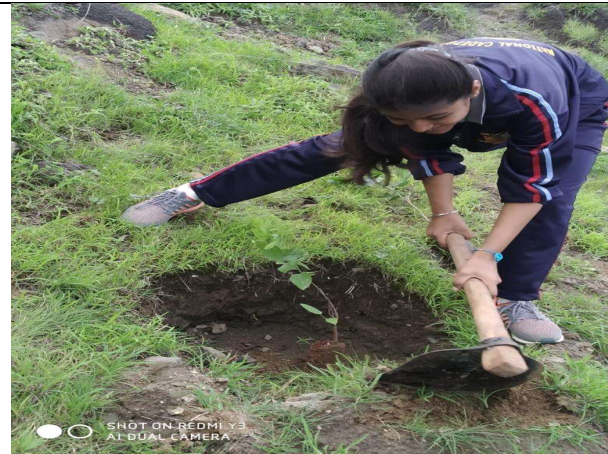
TREE PLANTATION DURING PANDEMIC