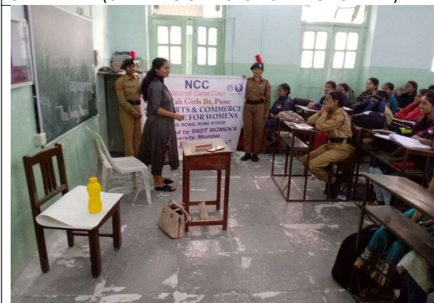
SEMINAR ON PLASTIC WASTE MANAGEMENT