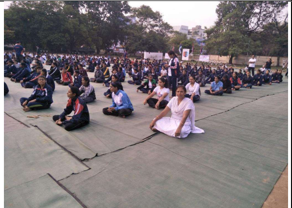
INTERNATIONAL YOGA DAY, 2 MAH GIRLS BT. UNIT

Motto of NCC Unity and Discipline एकता और अनुशासन