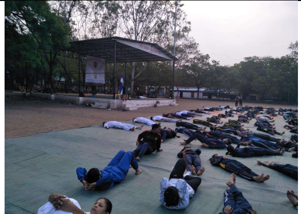
INTERNATIONAL YOGA DAY, 2 MAH GIRLS BT. UNIT