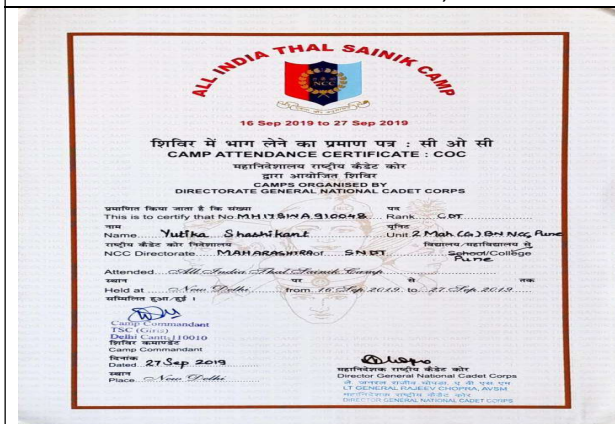
THAL SAINIK CAMP, DELHI