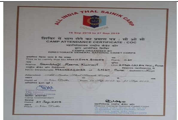
THAL SAINIK CAMP, DELHI